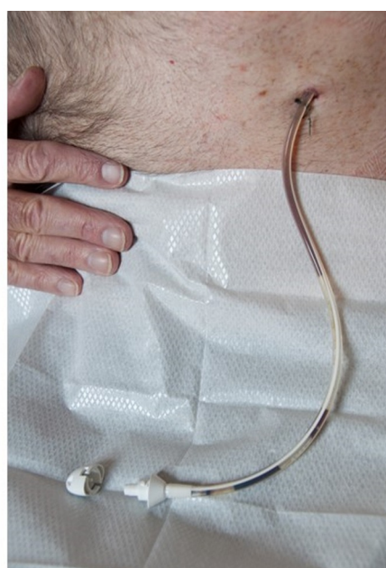
Fig 3 Indwelling pleural catheter, dressed (left) and undressed (right) before drainage